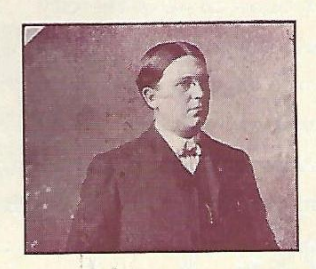
F. das Kingsbury Ye Coate Maker